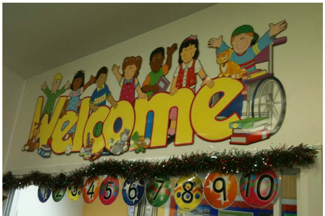
Primary school in Nottingham

c. Enabling persons with disabilities to participate effectively in a free society. (full text of article 24 can be found at appendix 1)