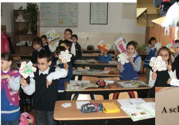
Differentiated learning in Romania