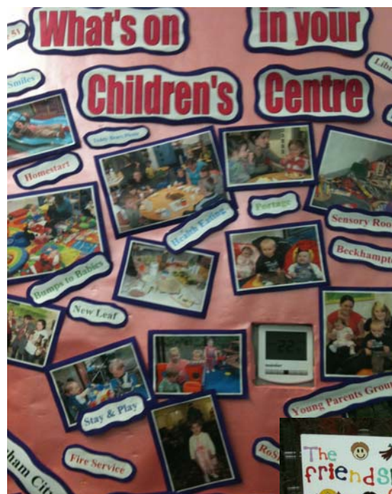
Information for parents

The information in the following five tables is there for you to include or adapt into a different format depending on which is most appropriate for your work needs, the stakeholders you may work with or different audiences.