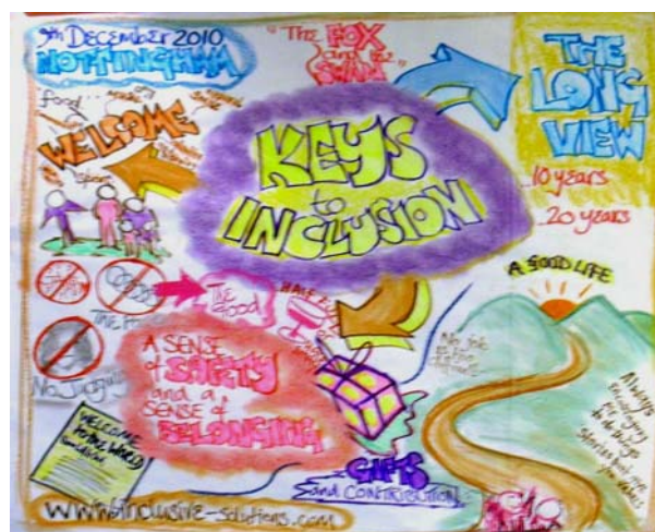
Nottingham session for professionals