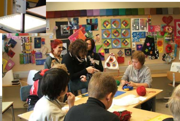
Peer to peer support in Italy