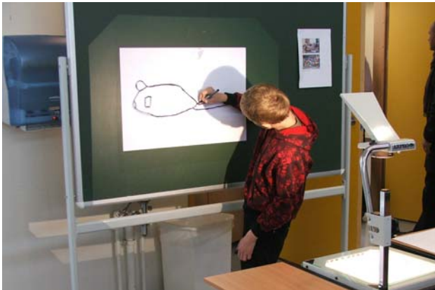
Disabled student in Iceland using visuals to learn

We hope this guide assists professionals working in education and in other related areas to discuss promote and support the development of inclusive practice for all disabled learners.